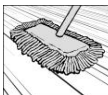
Sweep dust & grit to avoid scratches

Spot repairs can also be carried out quickly and almost invisibly with either the 2K Impact Oil or Parkett Wax depending on the severity of damage.