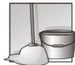
Mop when needed with Loba wax cleaner or Parkett Soap